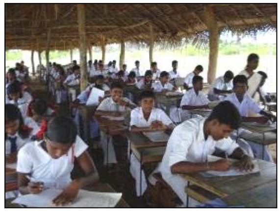
Displaced School - Thevanpiddy GTMS