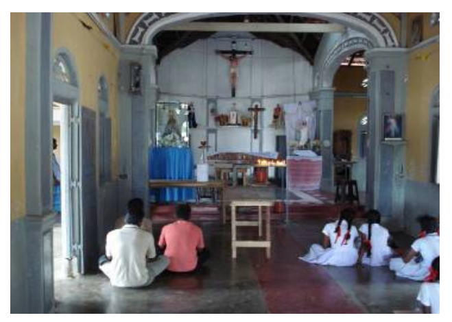
St Sebastian Church – Thevanpiddy (interior)

The Tamil Rehabilitation Organization (TRO) continues to make arrangements and transport the IDPs from the place of displacement to the areas they wish to be temporarily settled. TRO is also constructing and providing shelters, drinking water, health, Non-Food Relief Items (NFRI) and other emergency relief assistance. The UN, iNGOs, and local NGOs are providing medical and other humanitarian assistance to the IDPs.