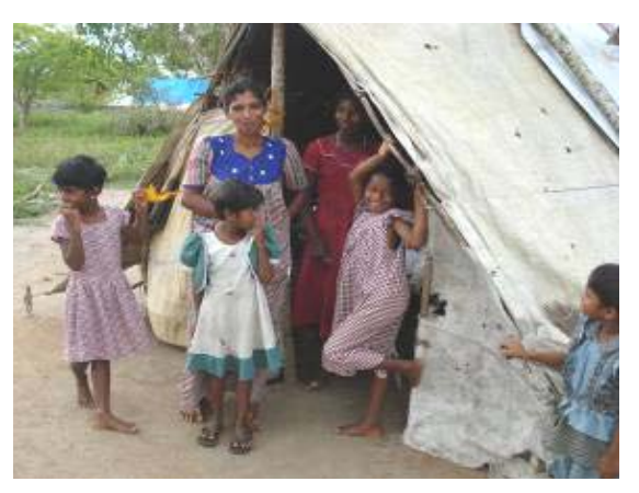
IDP Family from Vellankulam