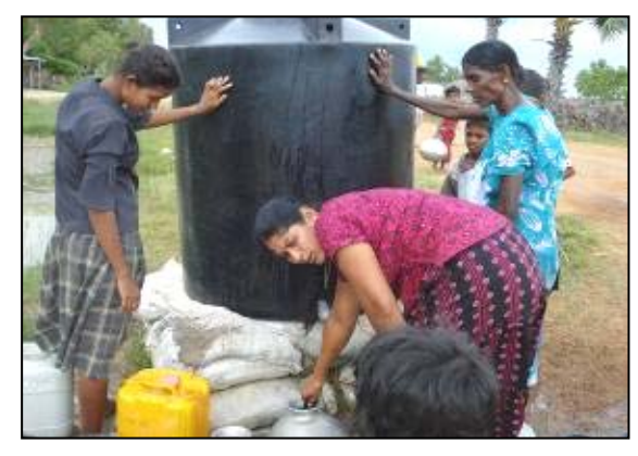
IDPs collecting drinking water in Mullankavil IDP Camp