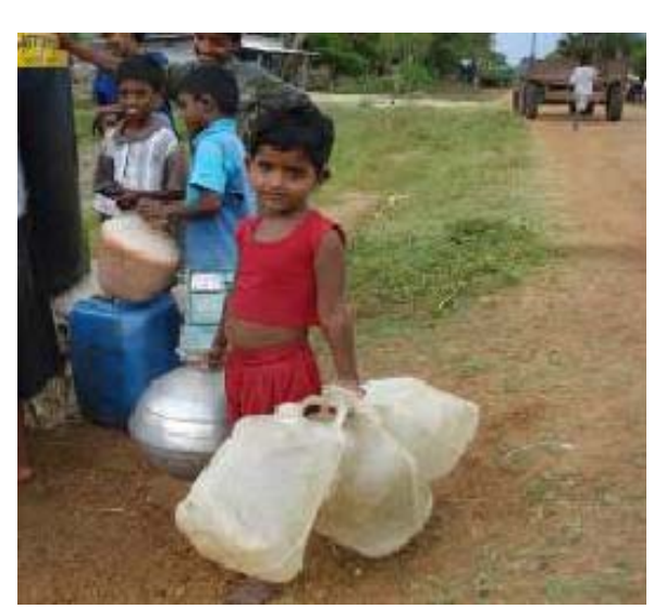
Five year old girl displaced from Mannar. This is her first experience of war as she was born after the 2002 Ceasefire Agreement.

All the Internally Displaced Persons (IDPs) were provided safe, temporary accommodation in the areas mentioned