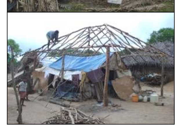
IDPs building their Temporary Shelters with materials provided by TRO

toilet per four shelters. At the current rate of displacement this is not enough for health reasons.