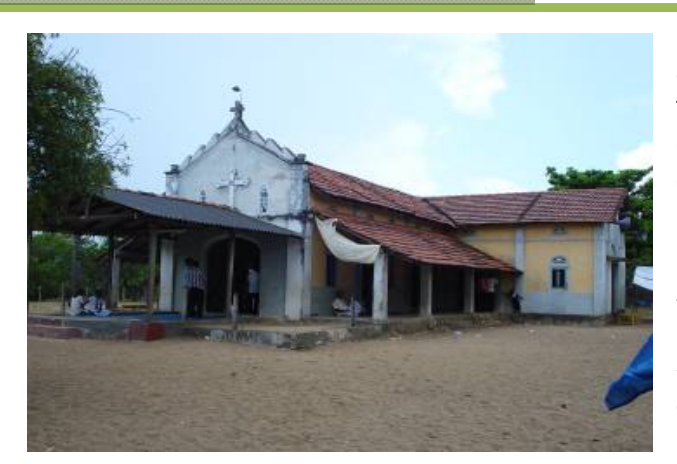
St Sebastian Church – Thevanpiddy (exterior)

Headquarters Office: Jaffna Road (A9) Kilinochchi