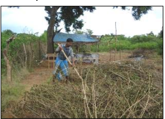
IDP clearing jungle to erect temporary shelter

toilet per four shelters. At the current rate of displacement this is not enough for health reasons.