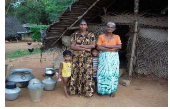
IDP Family from Madhu Church area

Periyamadhu (where they displaced from) and Kanesapuram are in close proximity as such we would like to stay in Kanesapuram. We are in a safe area now, but we need temporary shelters and access to drinking The overhead water tank that MANREP was constructing is not completed. We therefore need water tankers to bring drinking water. We also need to erect temporary toilets to prevent a disease outbreak. We welcome the erecting of 87 toilets built by SOLIDAR at the rate of one