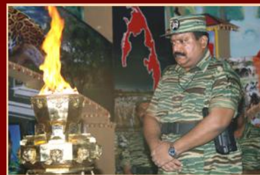
On the left: Our National Leader lighting the main fire on Heroes' Day 2006. Unshakeable determination and clear vision for the freedom and self-determination of Tamils.

A liberated Tamileelam, within his lifetime.