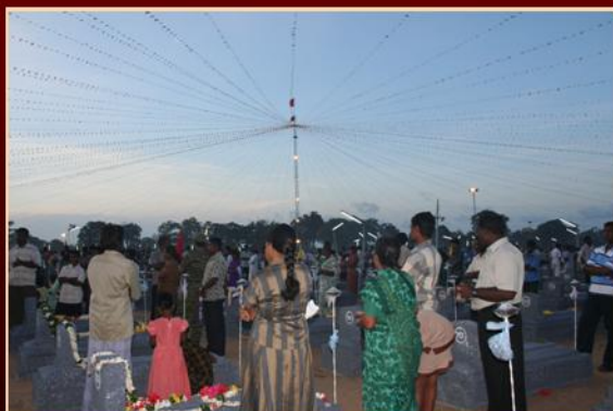
Clockwise: A cadre carrying his daughter to the Martyr's Resting Place (top); A child, paying homage in front of her relatives grave-stone (right); Crowd gathered to hear our National Leader's speech and pay homage to their fallen heroes.