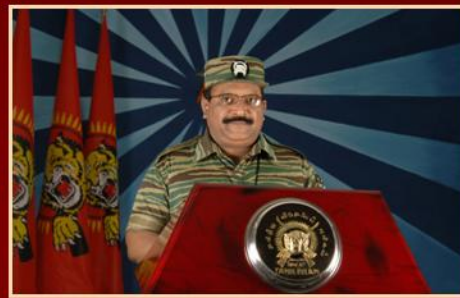
Left: Heroes' Day Speech November 27 2006