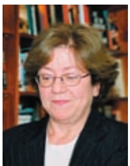
Dr Carmen Lawrence