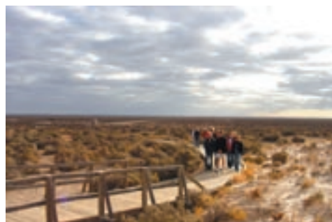
Mungo National Park, New South Wales