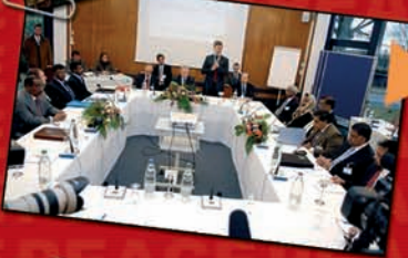
Geneva talks 2006