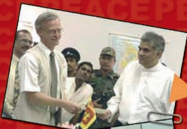
Cease-Fire Agreement 2002