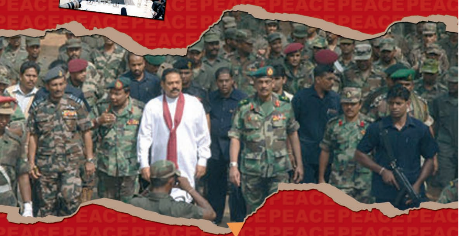
SL President at Vaharai 2007