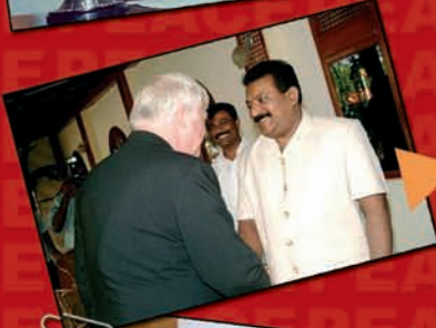
LTTE Leader with European Commissioner for External Relations 2003