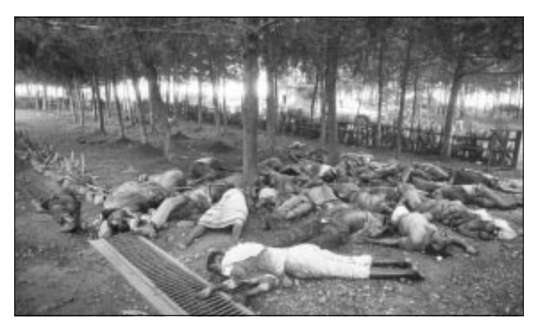
Fig 2 Victims of a massacre by Hutus in Rwanda

Group inequality-There is consistent evidence of sharp horizontal inequalities between groups in conflict.<sup>17</sup> Group inequalities in political access are invariably observed-hence the resort to violence rather than seeking to resolve differences through political negotiation. Group inequalities in economic dimensions are common, although not invariably large (such as in Bosnia<sup>18</sup>). Horizontal inequalities are most likely to lead to conflict where they are substantial, consistent, and increasing over time. Although systematic cross country evidence is rare, one study classified 233 politicised communal groups in 93 countries according to political, economic, and ecological differences and found that most groups suffering horizontal inequalities had taken some action to assert group interests, ranging from non-violent protest to rebellion.4