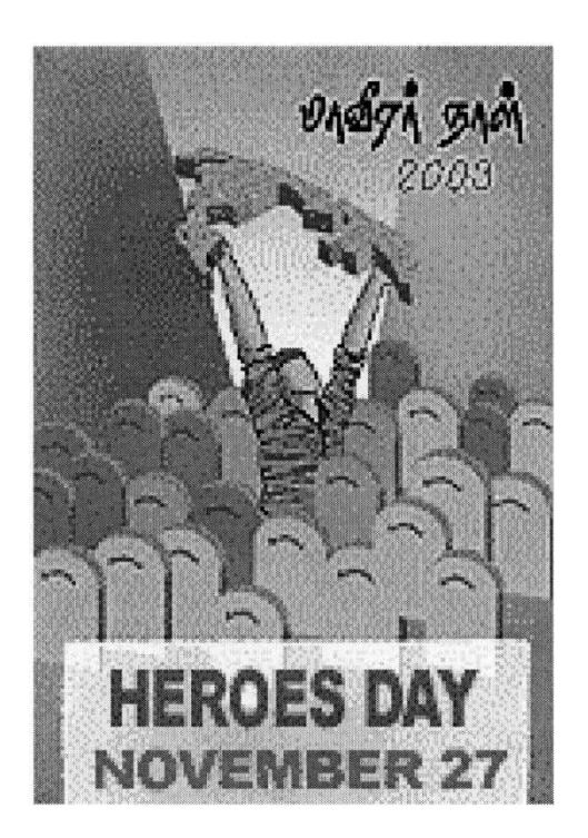
Figure 1 A Picture Accompanying the Reports on Heroes' Day<sup>1</sup>

Dagmar Hellmann-Rajanayagam Universität Erlangen-Nürnberg