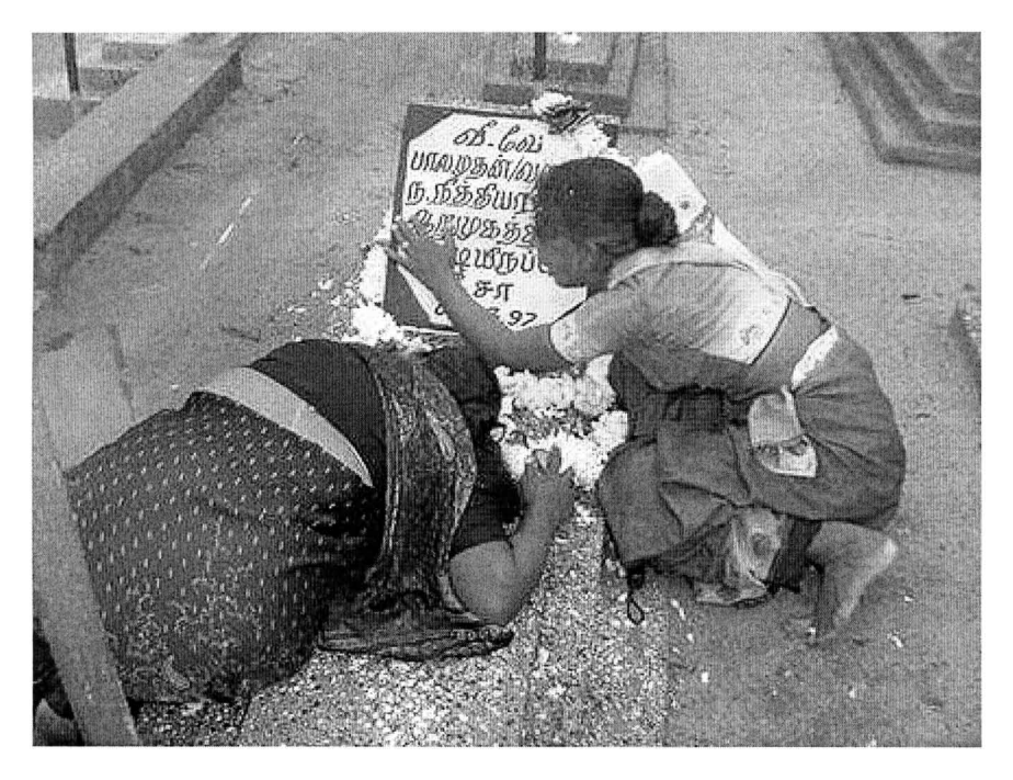
Figure 3 Women Mourn over the Natukal of a Fallen Relative.<sup>36</sup>