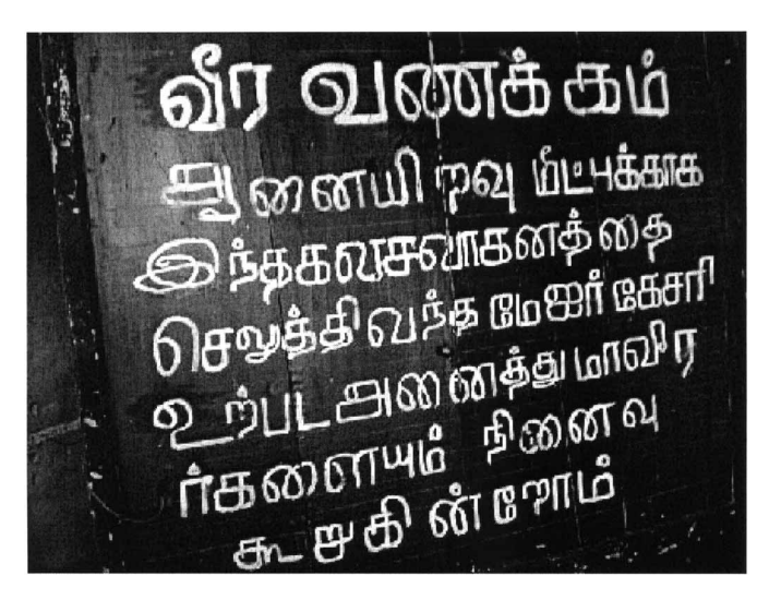
Figure 5 This Inscription reads: 'Heroic Greeting. We Express Our Remembrance to All the Heroes including Major Kecari who in Order to Liberate Elephant Pass Advanced on this Armoured Vehicle'78