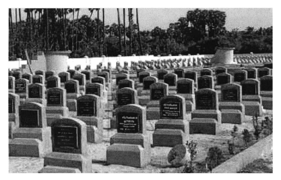
Figure 2 Visvamadu Cemetery, Killinocchi District. The Caption Reads: 'You Shed Your Blood for Us! Shedding Tears We Congratulate and Salute You'<sup>33</sup>

dead soldier-sons, though sometimes one could see the term tiyakacilam (model of sacrifice) designating an unknown soldier. Many tables bore faded flower garlands put there by family members.