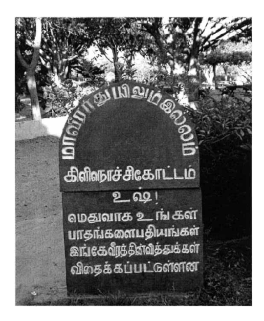
Figure 6 Memorial Stone at the Entrance to Killinocchi Cemetery. The Inscription reads: 'Hush! Tread Softly Here. Here Have Been Put to Rest the Heroes' Bodies as Seed'81

Christianity. 82 But more explicit is the reference to classical literature—to the songs of Cankam times. As in the foregoing poem, the fame of the heroes becomes immortal. 83