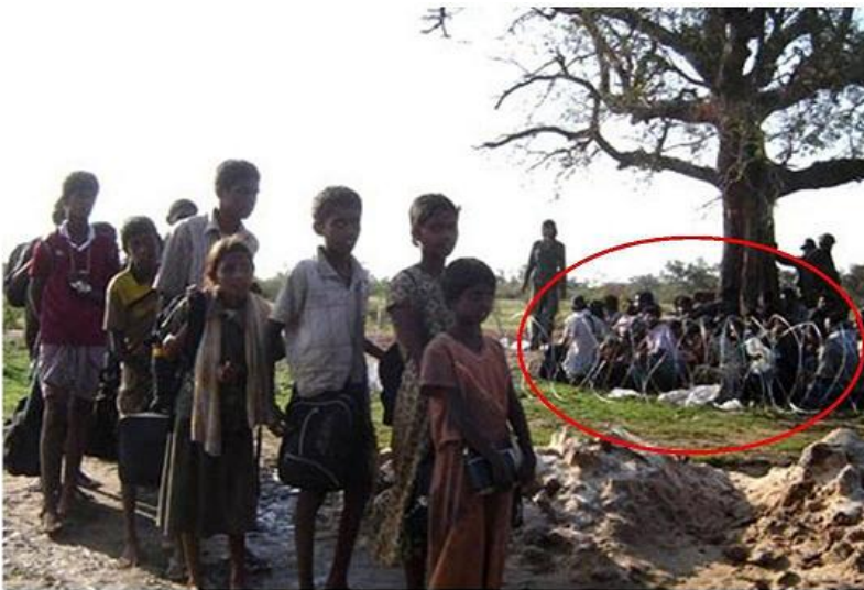
Mothers and fathers are forced inside the wired fence and their children are taken away. Not sure they will ever return

Children are separated from mothers and fathers and sent to different camps. People are treated like wild animals. Food packets are thrown at them from military vehicles. They are forced to drink unclean water collected from irrigation tanks.