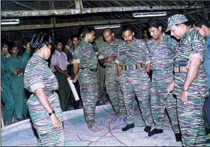
Conventional Tamil Army that defends the Tamils from State Terrorism

According to the recent survey, 99% of the Tamils support the LTTE and see them as their representatives even though they had made few tactical mistakes in the past.