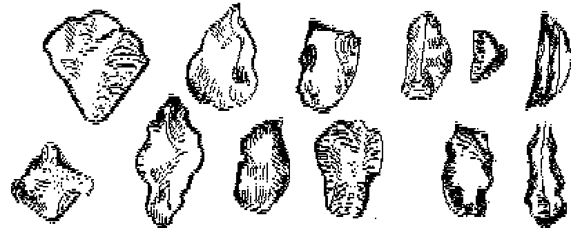
Fig. 1. Old Stone Age Implements

The first stage of human life is called the Old Stone Age. The people of this period used crude and rough stone implements for hunting the animals. These implements were made of quartzite or hard rock. Therefore, this period is named as the Old Stone Age. The implements of this period are found in several parts of Tamil Nadu. Robert Bruce Foote had first discovered the Old Stone Age implements at Pallavaram near Chennai. Later, similar discoveries were made in the districts of Kanchipuram, Vellore and Thiruvallur.