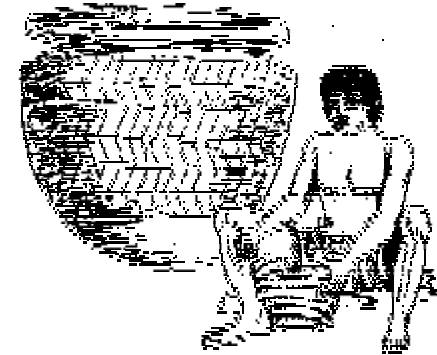
Fig. 4. Using the wheel for making pottery

The discovery of wheel was a remarkable event in the life of man. The New Stone Age people used wheels to carry goods from one place to another. They also used the wheel for making pottery. In Tamil Nadu, the New Stone Age potteries have been discovered in the districts of Tirunelveli, Salem, Pudukottai and Tiruchirappalli. Burial urn, water pots, lamps and other vessels of this period have also been found in these places.