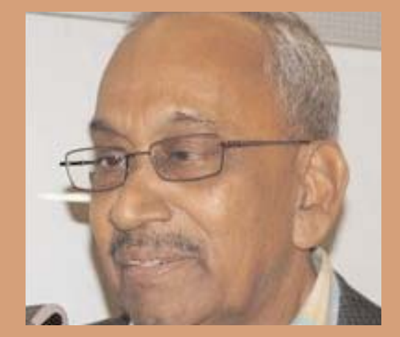
Does it condone terrorist killing by the state?

he Tamil Diaspora, through the International Federation of Tamils (IFT) expresses its shock and revulsion at the International Community's (IC) failure to condemn the murder of Joseph Pararajasingham, a member of Parliament and peace activist, during the midnight Christmas service, in the provincial cathedral of Batticaloa. The stony silence maintained by world democracies gives room for interpretation as IC's condoning of the assassination, an act of terrorism. In the new environment where extreme nationalists and Buddhist chauvinists are on the upswing in Sri Lanka, the continued silence of the IC may encourage culprits to go on an unbridled rampage comparable to the Black July of 1983.